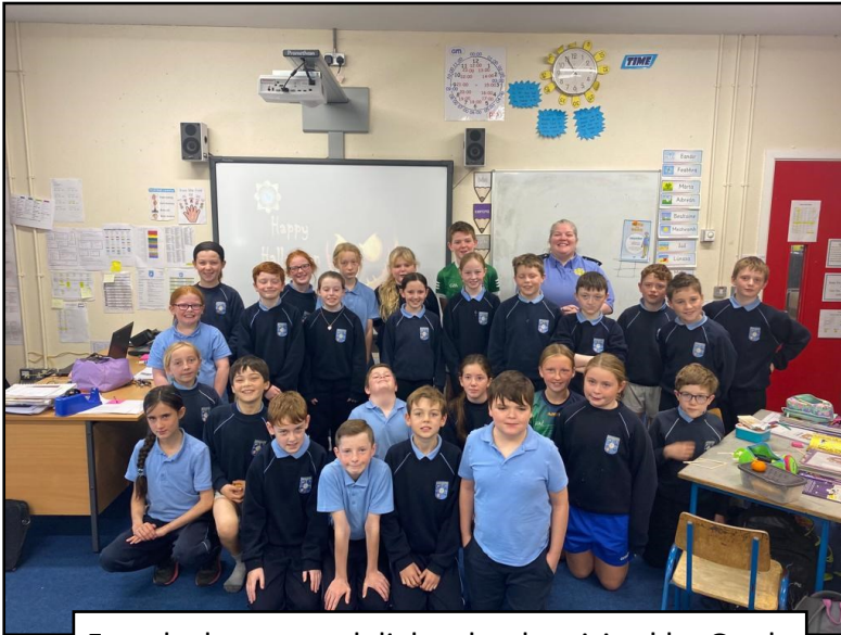
Fourth class were delighted to be visited by Garda Olga who gave them a talk on Halloween Safety and equipped them with the knowledge to make safe choices at Halloween.