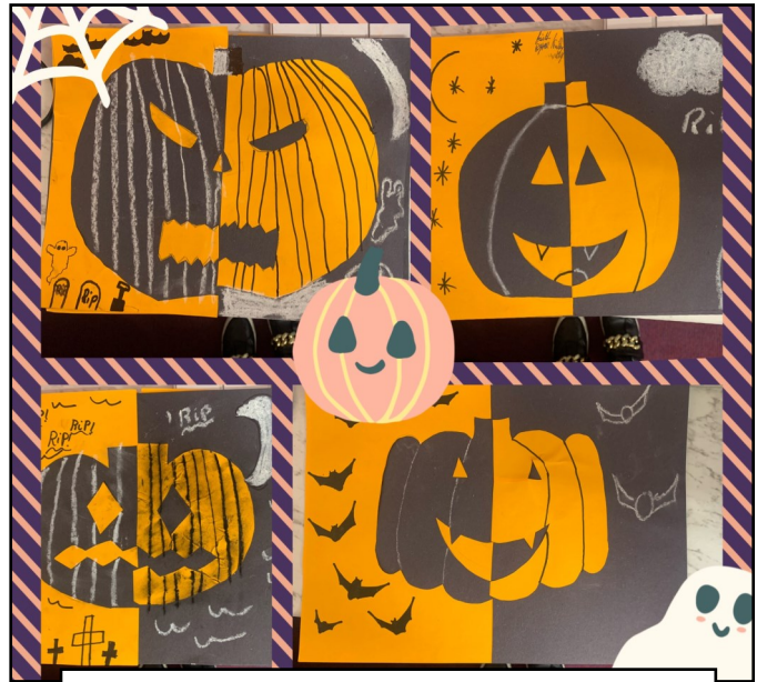
Fifth class made pumpkin symmetry art.