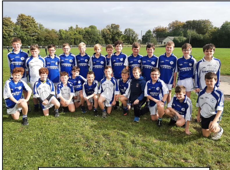
Our 2022/2023 boys football team.