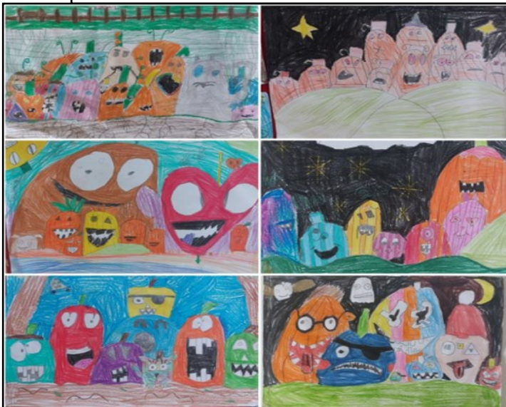
Second class created Crazy Pumpkin Patches.