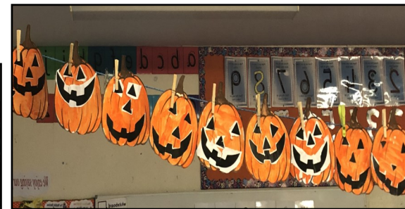
Junior Infants were busy making autumn and Hallowe'en art.