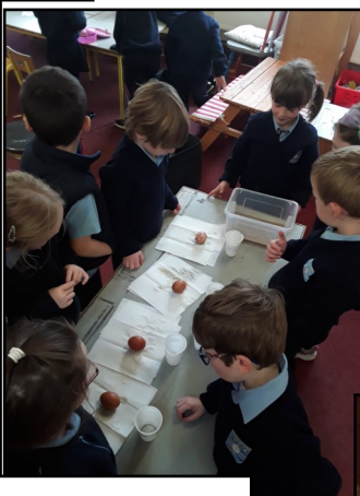
Senior Infants were busy investigating the effect water, coke, tea and vinegar have on the enamel of our teeth by completing an experiment with eggs.