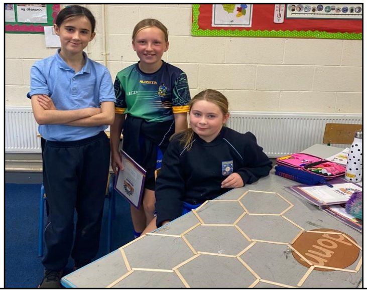
Fourth class were learning about the properties of 2D shapes and shapes that tessellate. A tessellating shape is one that can be repeated over and over to create a pattern that has no gaps or overlaps. The children made their own tessellating shapes in groups.