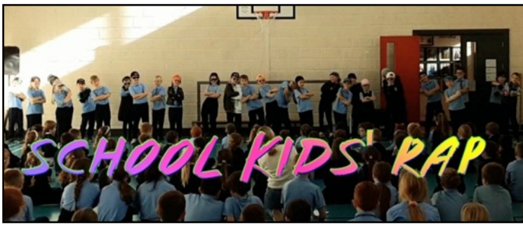
Rang a Dó did a performance for the school during our Friday assembly. We sang The School Kids' Rap and the song What I Am. You can watch our performance on the 2 nd class news page on the school website.